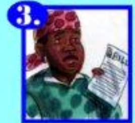
Not Paying bills every month