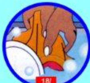
Washing Dishes In Unblocked Sink.