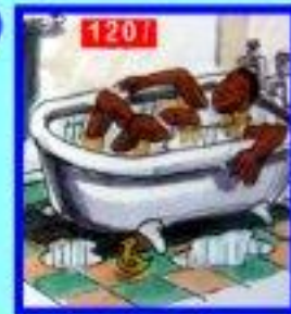
Taking A Bath